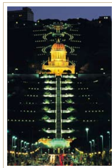
The Shrine of the Bab on Mount Carmel in Haifa, Israel.

Thousands of Bahá'í pilgrims come each year to pray at the shrines, and the sites also attract more than a half million visitors and tourists annually.